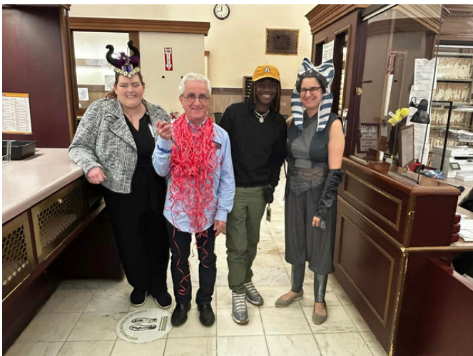
Halloween Fun 2022!