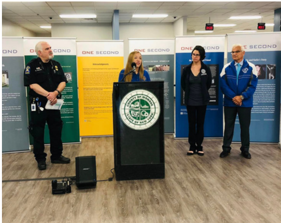
Raising Awareness with Monroe County STOP-DWI

Throughout 2022, all Monroe County DMVs continued to make the most of their close to 500,000 annual transactions by partnering with Monroe County STOP-DWI, New York Donate Life, and Monroe County's first ever PRIDE Committee to help share important information with every person who visited any one of our four locations.