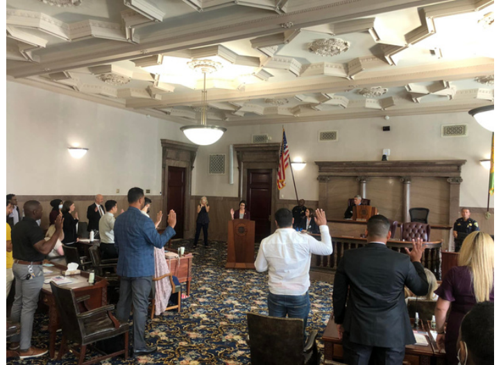
Reciting the Oath of Allegiance at a Naturalization Ceremony