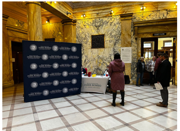
Flu and COVID Booster Clinic