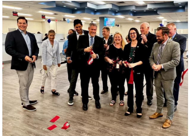
Ribbon Cutting at the new Henrietta DMV Branch